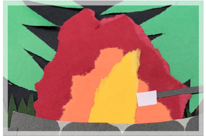
2. TEARING: Ripping the paper by hand to create a unique texture