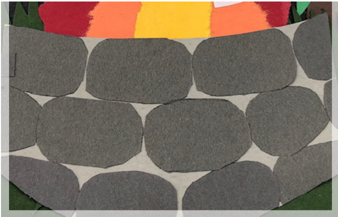
3. PATTERN: Repeating shapes on a background