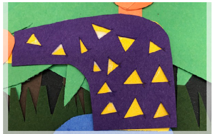
4. CUT OUTS: Cutting designs into one paper and laying it onto another color