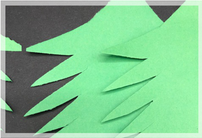
1. OVERLAP: Placing cut paper shapes on top of other cut paper shapes