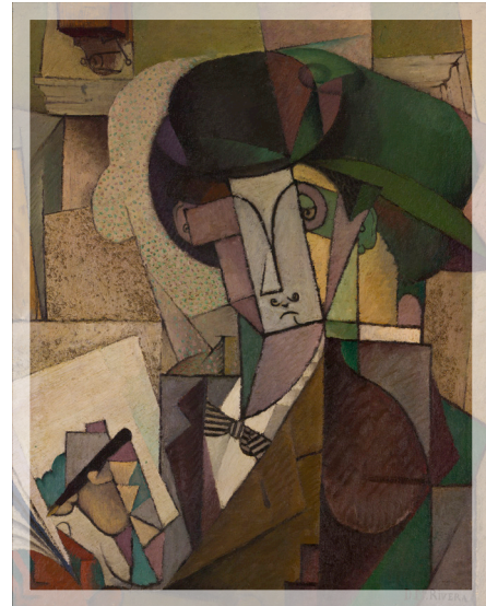
Diego Rivera. (1914). Young Man with a Fountain Pen [Oil on canvas]. Museo Dolores Olmedo. Mexico City, Mexico.

Colors, shapes, etc. do not match real life