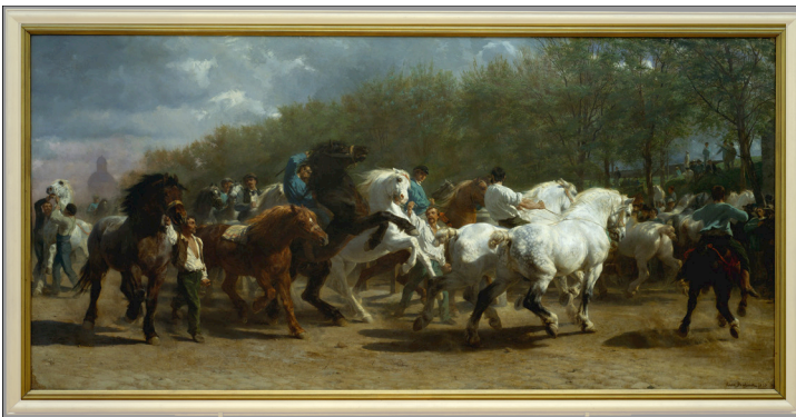
Rosa Bonheur. (1852-1855). The Horse Fair [Oil on canvas]. Metropolitan Museum of Art, New York, NY.